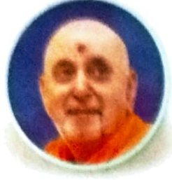
બ્રહ્મસ્વરૂપ પ્રમુખસ્વામી મહારાજ